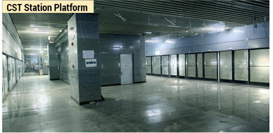
CST Station Platform