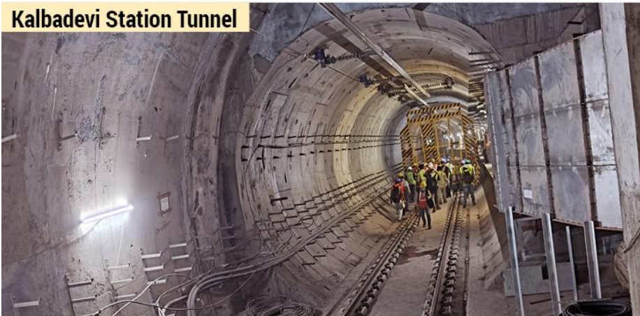
Kalbadevi Station Tunnel