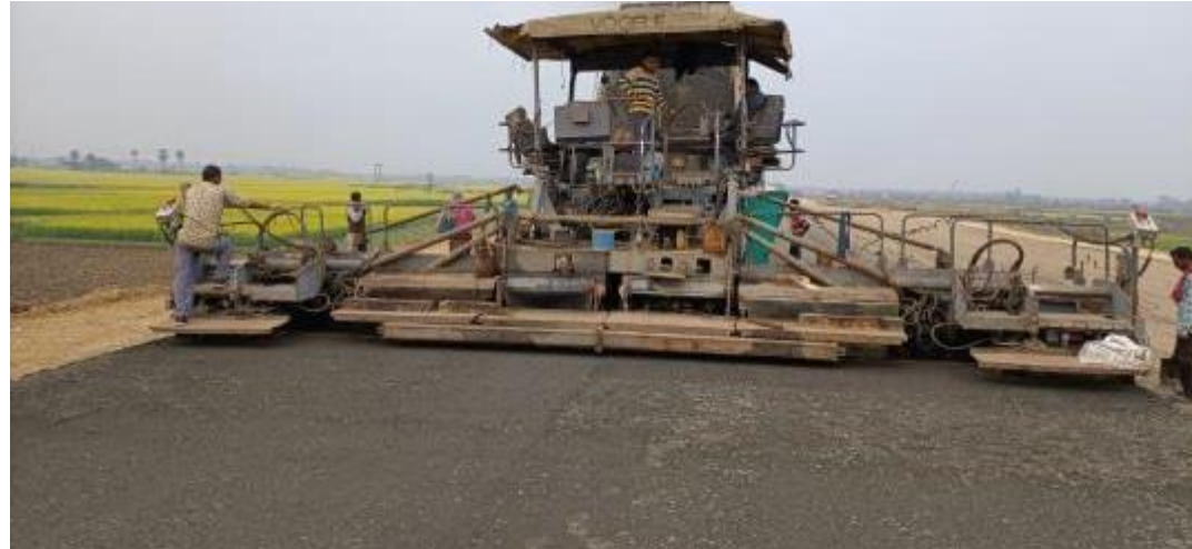
Road works at Baharampore Bypass