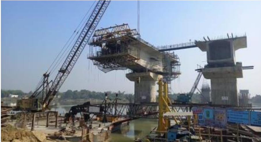
Bhagirathi bridge super structure works at Baharampore Bypass